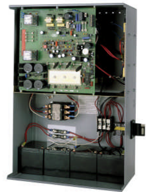
Reynolds & Reynolds Electronics' Traction Powervator

The first OEM to marry this technology with their elevator system was KONE on their T-REX Project in July of 2003 as specified by Lerch Bates. T-REX was a Transportation Expansion Project that transformed the way people in the metro Denver area traveled along the southeast corridor of Interstates 25 and 225. The project used a multimodal transportation approach to address some of Denver’s traffic problems and was referred to as “the next generation of transportation projects” on the www.trexproject.com website.