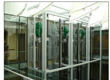
KONE'S EcoDisc in a Machine Room-Less Application

technology for low to mid rise buildings. KONE states that it was the first elevator escalator company to introduce the Machine Room-Less concept to the industry and to this day, has installed over 300,000 worldwide.